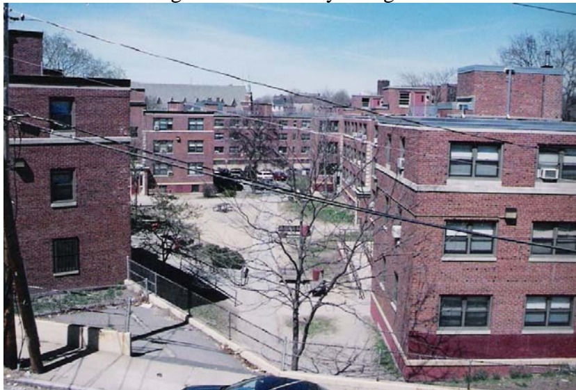
South Street Apartments, Public Housing in Boston

Housing Authorities are responsible for determining eligibility as well as management and operation of the public housing developments. Specifically, housing authorities make sure that households maintain compliance with the lease, perform reexaminations of the household income at least once every twelve months and transfer families from one unit to another if needed to prevent over and under crowding. They also terminate leases when necessary and are responsible for ensuring safe and sanitary living conditions.