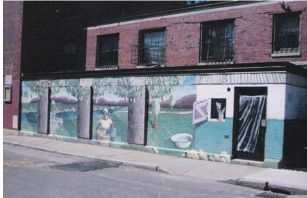
South Street Apartments, Public Housing in Boston

Massachusetts has historically been a state with high housing values and low homeownership. Massachusetts ranks 41 st in the nation in homeownership rate with only 65% of the householders owning their own home. Just about 8% of the housing units in the state are publicly subsidized and another 70,000 households receive some rental assistance (DHCD, HMA, 2005). Counting populations in both publicly subsidized housing as well as those receiving rental assistance, approximately 25% of the renter's in Massachusetts benefit in some way from publicly funded housing assistance (DHCD, HMA 2005). This is in no small part due to the high costs of housing in the state. The National Low Income Housing Coalition deemed Massachusetts the most expensive state in which to rent a home (NLIHC, 2004).