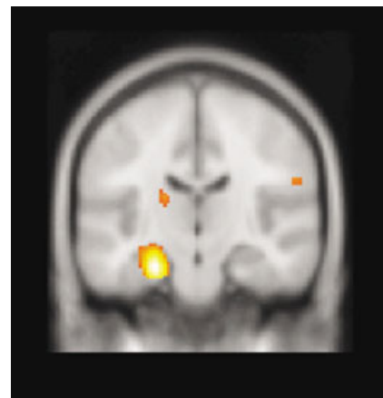
FIGURE 1. Results of the High vs Low comparison in positron emission tomography (PET) data pooled across all participants. The coronal image displays regional cerebral blood flow (rCBF) increases in left hippocampus ( z = 3.88 ; MNI coordinates x,y,z = -24, -18, -22 ) superimposed on a canonical SPM99 T1 template. This image is displayed according to neurological convention.

A voxel-wise Condition \times Group interaction revealed rCBF increases in the High vs Low Recall comparison that were greater in the Control group than in the PTSD group: hippocampus ( z = 2.40 , MNI = -28, -16, -24 ), fusiform gyrus ( z = 3.24 , MNI =