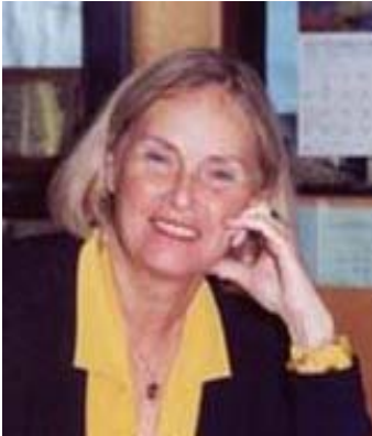
Not what we give, but what we share, for the gift without the giver is bare. James Russell Lowell

This fall marks the 5 th Anniversary of the Osher Lifelong Learning Institute @ TUFTS UNIVERSITY. It is appropriate to express our appreciation on behalf of the membership to Tufts University and to the Tufts Alumni Association for its many kindnesses and for offering and supporting this unique opportunity to us, whether we are neighbors, friends, or relatives who believe that learning is a lifelong odyssey.